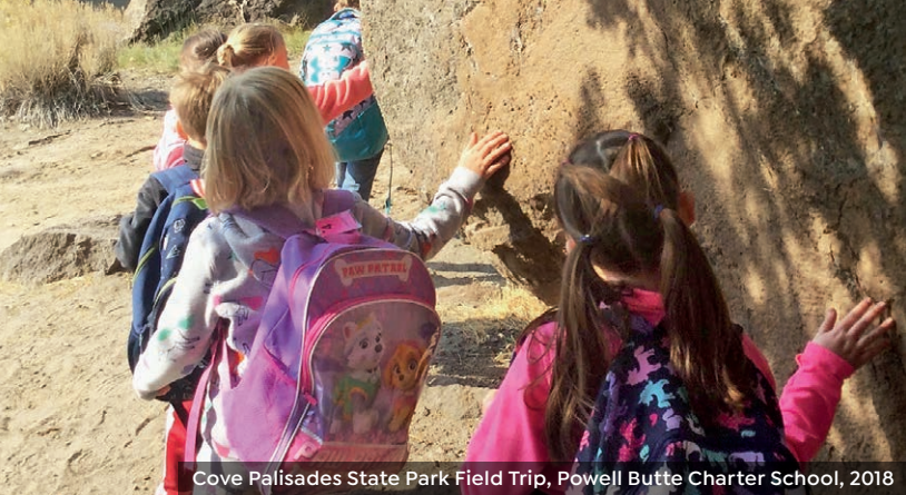
Cove Palisades State Park Field Trip, Powell Butte Charter School, 2018