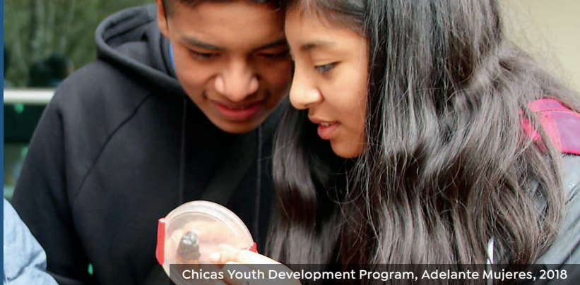
Chicas Youth Development Program, Adelante Mujeres, 2018