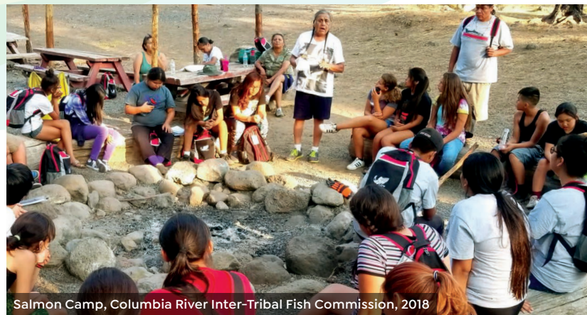
Salmon Camp, Columbia River Inter-Tribal Fish Commission, 2018

— SALMON CAMP PARTICIPANT Columbia River Inter-Tribal Fish Commission