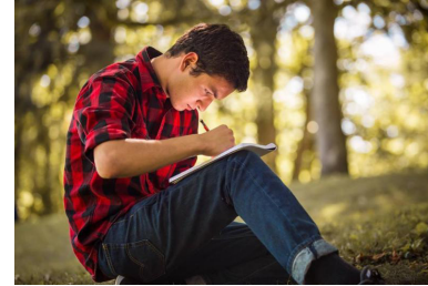
A student engaged in geography education, Springfield School District's MINE Program

Up to $330,000 is available this year from Gray Family Foundation for projects that align closest with our goals and commitment to equity and inclusion. We will consider grant requests from $5,000-$30,000 per year for projects one to three years in duration.