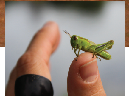
TILLAMOOK SCHOOL DISTRICT

Problem kids become leaders. Cliques disappear around the campfire. Nature's wonder surrounds them in three dimensions, dissolving a fear of science.